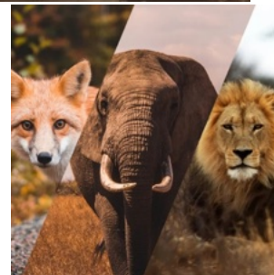
The origins of spirit animals